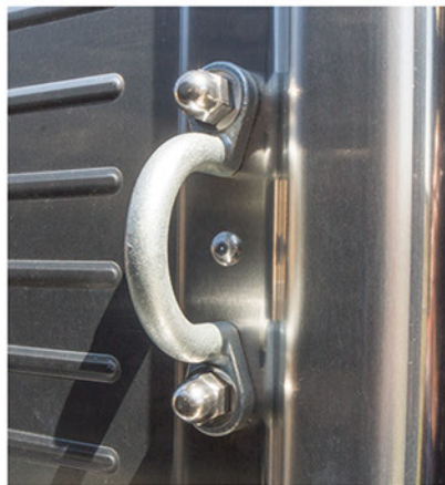
Outside Tie Loops