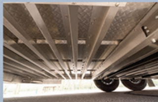
All aluminum sub frame with 6" cross bar spacing. The best floor strength in the industry.