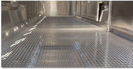
.110 Thick Flat Tread Plate with Crossbars on 6" Centers