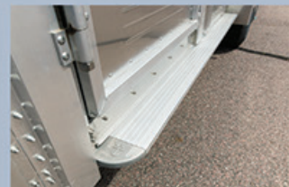
Large side door with full-length running boards.