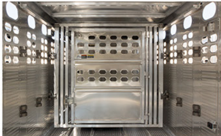
Style O – Roller Gate with Multiple Settings