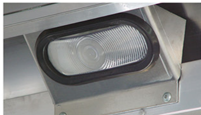
Extra Interior Lights