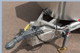
The beefy aluminum A-frame coupler provides strength to the trailer where it is important.