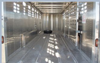
Full-width 84" interior.