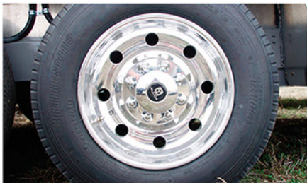
Alcoa Aluminum Wheels