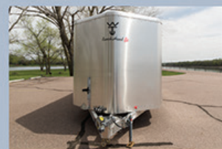
One-piece formed V-nose - no seams

You will feel confident knowing Wilson's superior quality, durability and lowest cost of ownership has been built-in to the structure of the trailer and not added on.