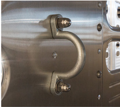
Inside Tie Loops