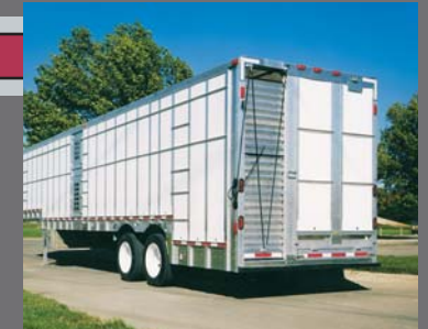
Protection from the Elements is Provided with the Addition of a Winter Kit Made of Lightweight Corraplast Panels as an Extra Cost Option.

Notice: All visual representations, dimensions, and specifications contained in this literature are based on the latest product information available at time of publication approval. The right is reserved to make changes in materials, equipment, design, specifications, and models, and to discontinue models.