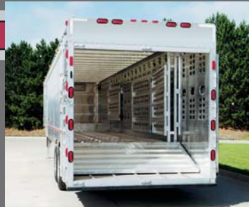
Full Swing Door with Full Width Ramp for Straight-Through Loading and Unloading.