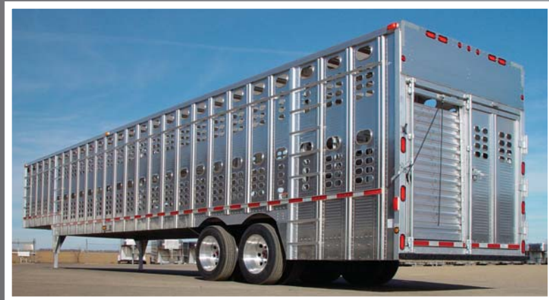
Model: PSAGL: Punch Side Aluminum Ground-Load Livestock

The StockMaster Punch Side Aluminum Ground-Load Livestock Trailer has a lowered rear threshold providing the convenience of loading and unloading almost anywhere without adjustable chutes. The riveted aluminum construction consistently delivers durability and value that has been time-tested by loyal Wilson customers for over a century. With StockMaster's smooth inside skin, superior ventilation, and minimum step-up, these same Wilson customers have confidence their valuable cargo will be delivered safely, securely, and successfully with minimal stress and strain.