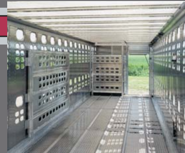
Inside View from Front to Rear. Smooth Interior Walls and Full Wrap-Around Hinge Collars Protect Against Livestock Bruising. Kemlite Roof for Visibility.