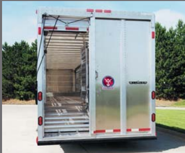
Left-hand Rear Roll-up Door (standard) and Reduced Step Ramp with Fold-to-Corner Bull Bar.